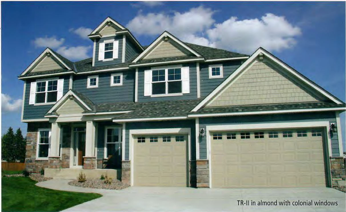
TR-II in almond with colonial windows

Elegantly Crafted to complement your home's architectural style.