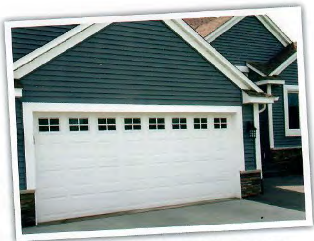
TR-I38 in white with colonial windows

The Forest Bay collection of insulated thermal doors combines the stylish appearance of wood grained embossment with the rugged durability of heavy gauge steel thermally bonded to dense polystyrene insulation. This collection delivers thermal efficiency available in three door thicknesses – 1 3/8, 2 and 3 inch, while offering a full range of colors and window options. Strength and beauty come together in one package tailor made to fit your tastes!